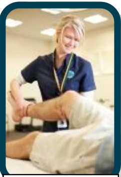
Allied & Community Health Services

Fundraising Department Kyabram District Health Service P. O. Box 564, Kyabram VIC 3619