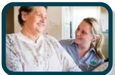
District Nursing Services

Although KDHS is Government funded, donations and bequests assist to purchase equipment and make improvements that are not funded but make life easier for staff and provide a nice environment for patients, residents and staff.