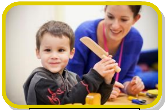
Early Childhood Intervention Services

When you leave a bequest in your Will to KDHS, it provides a legacy to be used to ensure the provision of quality care for the community, which could include: purchasing medical equipment that is not funded by the government, enhancing care programs, introducing new services, capital works, etc.