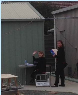
(from maintenance department)